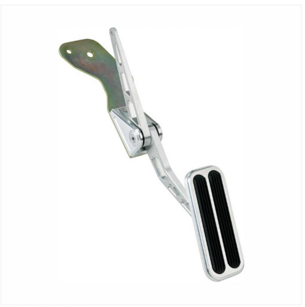
Data Base Conversion

Programmer's Guide and Reference Licensed Program 2A55XL1 V1R9M0